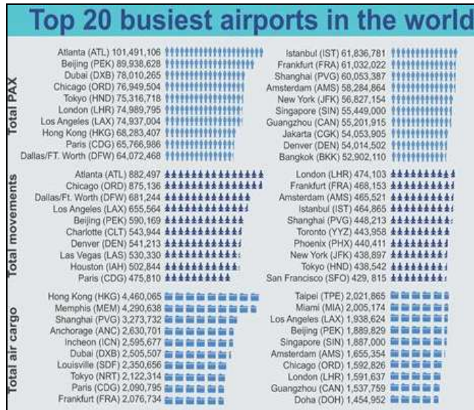
Fig. 1. Top 20 busiest airports in the World [8].

airport in the world. Hong Kong Airport is followed by Memphis (MEM) International Airport with a growth of 0,8% and Shanghai Pudong International Airport with a growth of 2,9%, subsequently [8]. On the other hand, by aircraft movements, Atlanta is the busiest airport with a growth of 1,6% followed by Chicago (ORD) with a decrease of 0,8% and is Dallas (DFW) with a growth of 0,2%, subsequently [9].