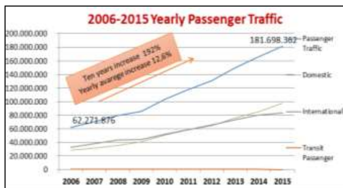
Fig.2. 2006-2015 yearly domestic and international total passenger traffic in Turkey

As a result of the regional aviation policy which came into action in Turkey in 2003, civil air transport operations showed rapid developments. In the last ten years (2006-2015), commercial flights showed an increase of 139%, passengers transported showed an increase of 198% and freight carried grew by 154%. The total of both domestic (national) and international passenger number which was 165.720.234 in 2014 showed an increase of 12.7% and became 181.698.362 in 2015 (Fig-2). The share of the passenger traffic of domestic (national) flights accounted for 52% of the total number of passengers [10].