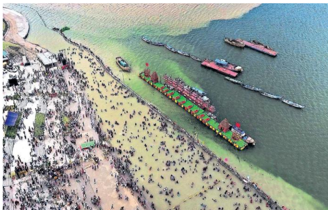
Fig.7. View of Krishna Pushkaram Celebrations, 2016.