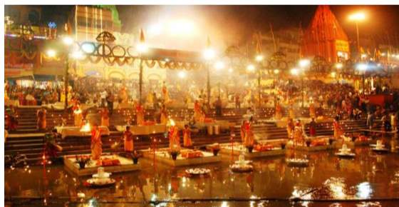
Fig. 5. Dasaswamedh Ghat, Varanasi