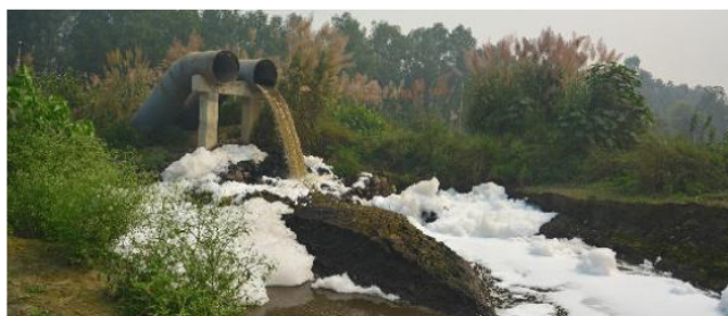
Fig. 4. Industrial Waste water outlets into Yamuna River

Today, there are certain challenges remained being tackled in the present day scenario of Yamuna river fronts even after existence of these many potentials. These challenges are mainly due to the transformation of the functioning of these riverfronts over a period of urban development and denied river edge which holds a great role in Delhi city development. Some of them are like High level of Pollution due to dumping garbage, unauthorized settlements on riverbed, Domestic sewage and Industrial waste water outlets into river, underutilized public spaces, absence of Mix of Functions and Safe Walking Condition, less priority to the significant and historical monuments located in close to the river while developing the river edge, absolutely absence of visual Linkages, physical linkages with riverfront.