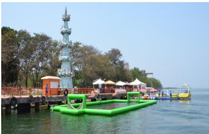
Fig. 6. Watersports near Bhavani Island, Vijayawada.

Krishna Pushkaram is the important river festival which is been celebrated once in twelve years and attracts lakhs of devotees from all over the country and some from abroad who participate in the ritual bathing in the river Krishna and offer pujas. Usually Krishna Pushkarams will be held at several banks of the Krishna River. These banks are generally called Ghats. As per AP Tourism Statistics 2016, tourists visited Vijayawada during Krishna Pushkaram in the month of August 2016 were 50 million in those 12 days of celebration. This Pushkaram brought up a lot renovation to the existing riverfront Ghats and also development of new Ghats to meet the religious requirements during the festival period. Fig.6. To attract the tourists, the government of Andhra Pradesh had taken an initiative of providing water based recreational activities in the Bhavani island in Krishna River. [11].