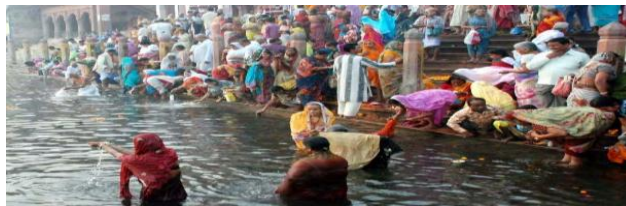
Fig 1. Yamuna riverfront in Delhi during Chhath festival, Oct 2016.

proximity to the river complements a special symbolism and meaningful expressionism to the Yamuna river front which showcases the dependency on the river, history and glory. Fig.2 & 3. "Chhath Ghat", which is extensively used during the 'Chhath' festival for people gathering in great number. Fig.3. Due to the location of Institutional and Office Buildings along this river, the riverfronts will be more lively and active during working hours of the city. [3].[5].