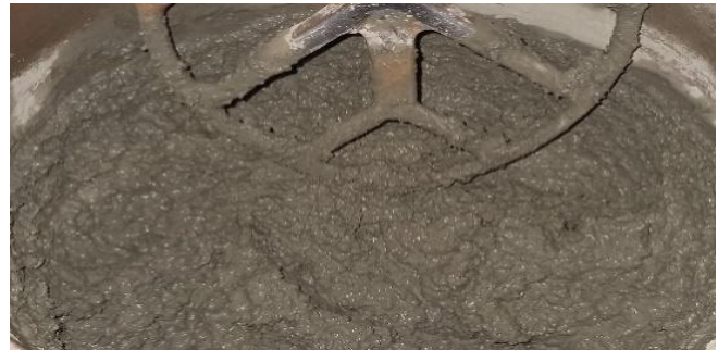
Fig. 2. Concrete without pigment

concrete industry, (ii) pigment recovered from the iron rich mine water, and (iii) concrete without pigment. The pigment was dosed at three content levels, 0%, 3%, 5% and 7% (Table 2). Pigments were in line with the recommended dosages of the pigment suppliers. The concretes produced were cured under normal conditions (i.e., in the curing room) and accelerated conditions using the curing chamber using steel mould casting prisms. Fig. 2 depicts concrete without pigment and Fig. 3 shows cement with pigment. Fig. 4 shows prisms in the curing chamber.