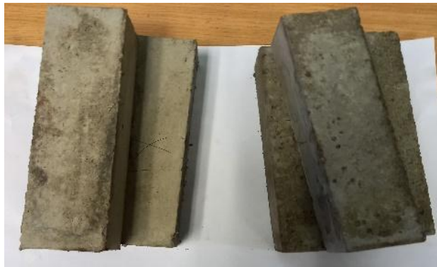
Fig.5: Concrete prisms for compressive strength test after 24 hours of curing.

Depending on the compressive strength age test, the demoulded concrete prisms were cured in a curing bath.