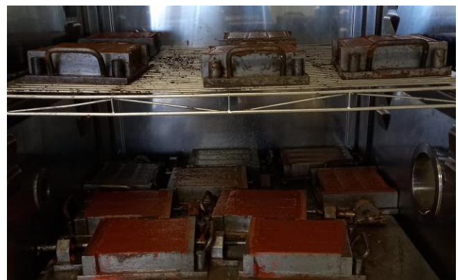
Fig. 4. Micro concrete prims in curing chamber operated at 90% humidity, 50°C for 3 hours