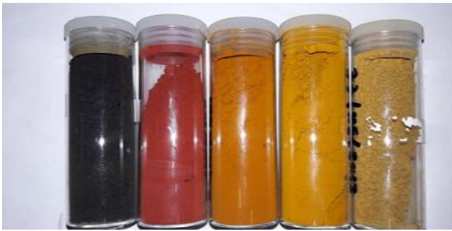
Fig. 1. Pigments recovered by acid mine water treatment