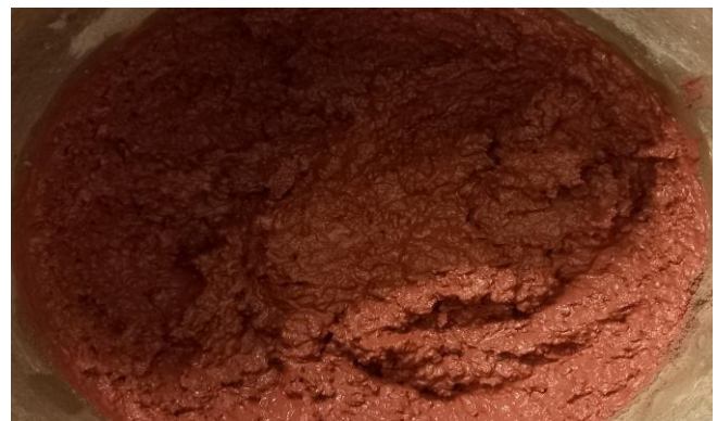
Fig. 3. Concrete with pigment