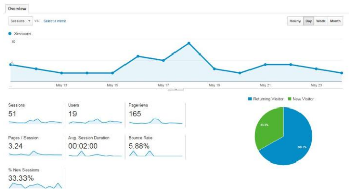
Fig. 3: Result of Google Analytic overall

The last week of testing this week seem the number of session decrease from 53 to 41 and new user decrease from 24 to 13 because in this week we have foreign country just only one most of the case is Thai people visit and re-visit so that bounce rate number is under fifty percent which seem interesting. From the result of three weeks that we have test our experiment we found the relationship between SEO ranking factors that they have their relationship people can't